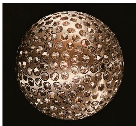
Fig. 2. LAGEOS, made specifically for SLR [Wikipedia: LAGEOS]